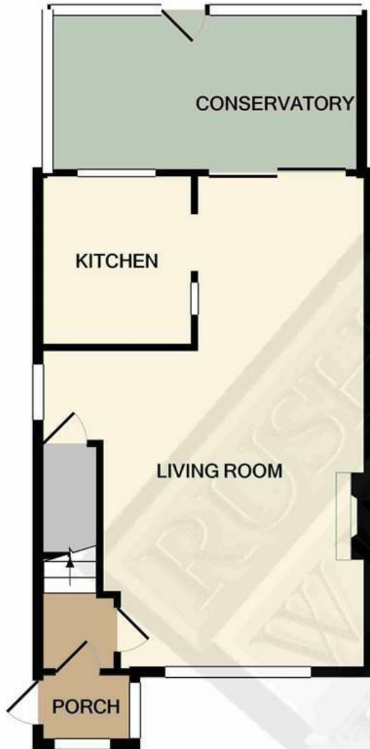
GROUND FLOOR APPROX. FLOOR AREA 454 SQ.FT. (42.2 SQ.M.)